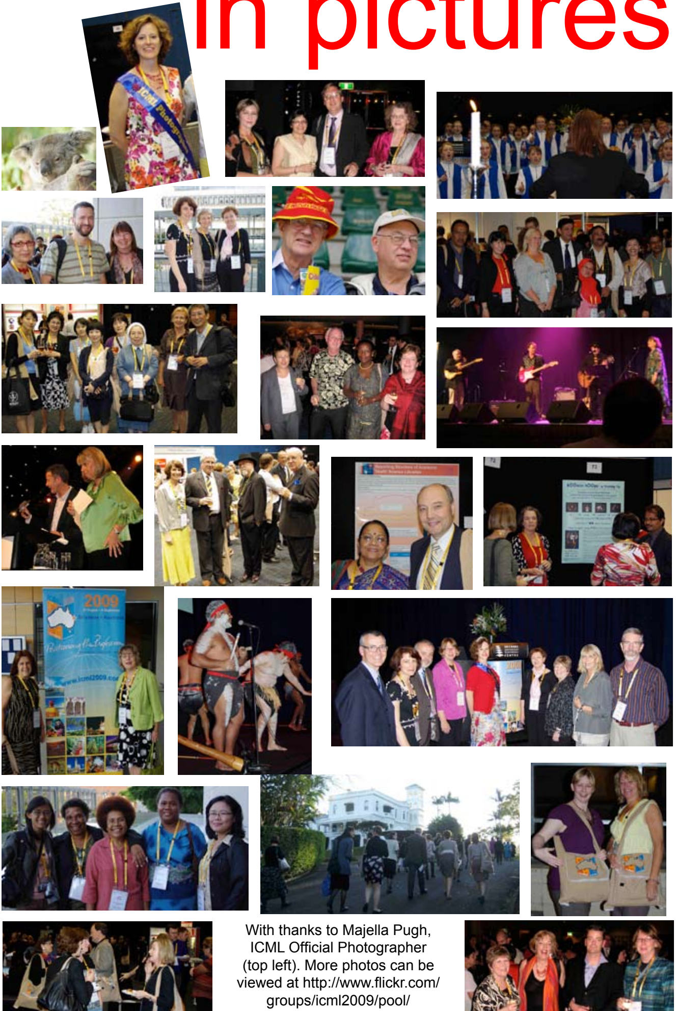
More photos can be viewed at http://www.flickr.com/groups/icml2009/pool/