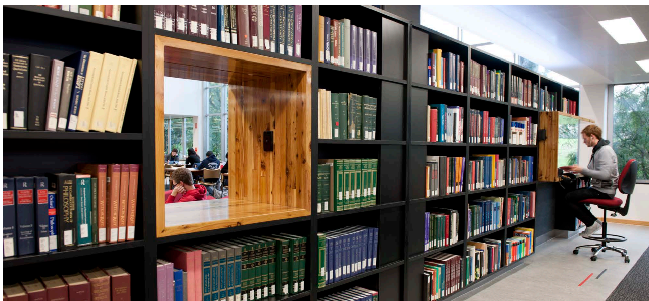
University of Melbourne

A July 2020 Australian Education Union State of our TAFEs survey 6 , the first such survey in ten years revealed major issues with workload, resourcing, staff support and increased compliance requirements. More than three quarters (76%) of respondents said that they had considered leaving the sector in the last three years.