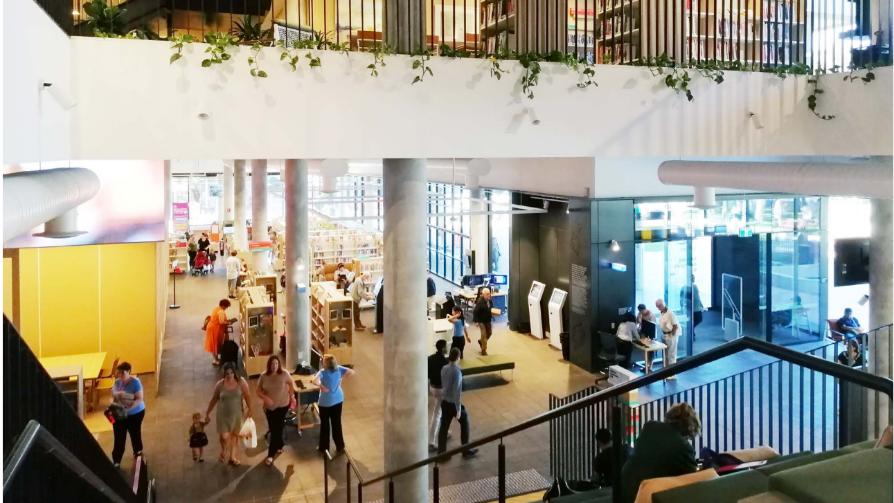
City of Salisbury SA